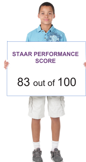
* Sample conversion chart.